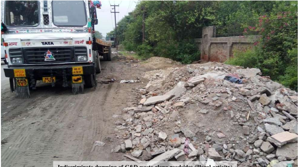
Indiscriminate dumping of C&D waste along roadsides (illegal activity) generates dust into the atmosphere (Photos - above & below)