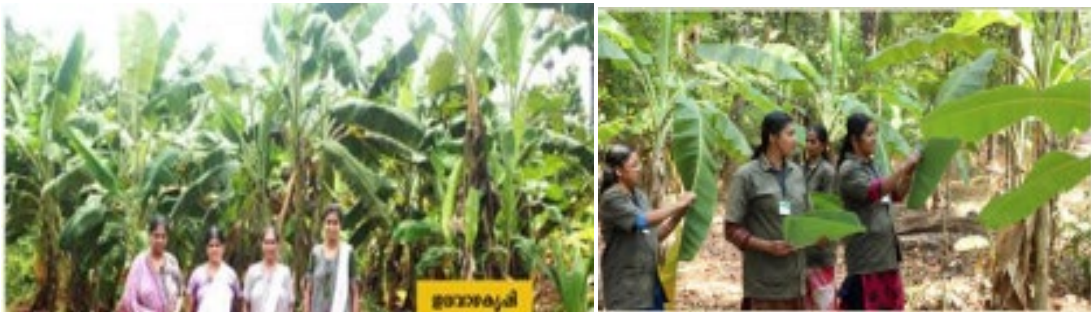
Figure 2.1 Banana saplings cultivated to promote green weddings