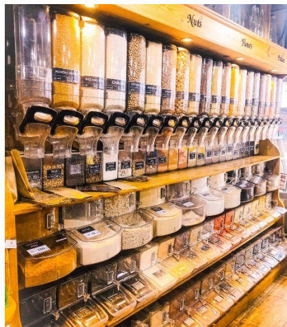
Figure 2.2 Reuse and refill models of consumption in Kerala-Zero Waste Store

Zero waste stores are retail establishments that aim to reduce waste and promote sustainable consumption practices. These stores operate on the principle of minimizing packaging waste, single-use plastics, and other disposable items commonly found in traditional grocery stores. The goal is to create a circular economy where resources are used efficiently and waste is minimized. 7to 9 Green store is a popular zero waste store in Kolencherry, Kochi. The store sells spices, organic foods and vegetables and encourages customers to bring their own containers and bottles for shopping and avoid plastics. They can also get paper bags, organic cotton bags or glass bottles from the store.